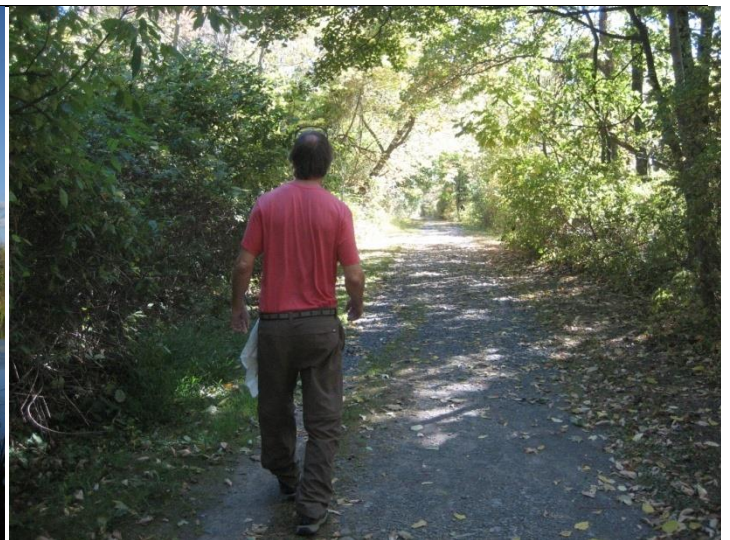
RamsHorn-Livingston Sanctuary: Farm Road