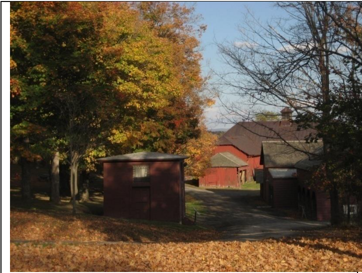
Olana – farm house