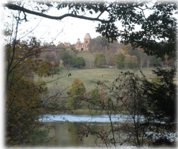
Olana – pond view

Olana is the late-1800’s home and estate of renowned Hudson River School artist Frederic Church. Olana offers all the elements of the Hudson River School of art: the splendor of nature, the divinity of creation, and our belonging in the outdoors. Here all the styles of the Hudson River School are evident: the sublime thousand-acre viewshed preserved by Scenic Hudson, the picturesque pastures and carriage roads through purposefully planted stands of trees, and its beautiful home with garden and grassy lawn.