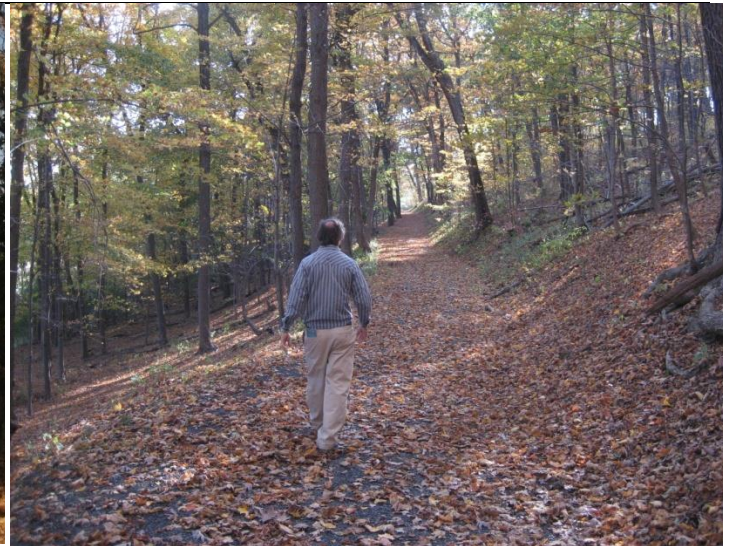
Olana – carriage road