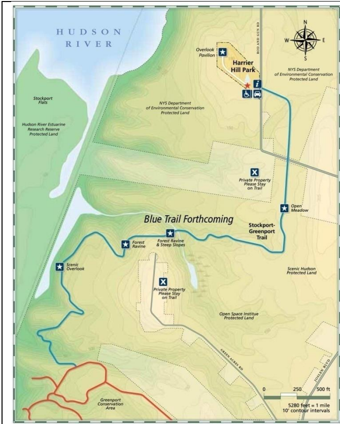
Harrier Hill Park map