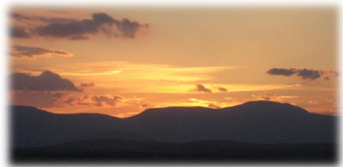
Harrier Hill Park

strata – red, brown, orange, green. This autumn day, as I travel up the Hudson River Valley, I see that Arizona trek paled in comparison as I witness vastly more textures, vistas, culture and history. I am bathed in the vast enticements of nature: mountains rising and ebbing from the valley, pastoral fields adorned with wildflowers, the charted channels of the Hudson River, and projecting through the fall foliage every spectrum of color.