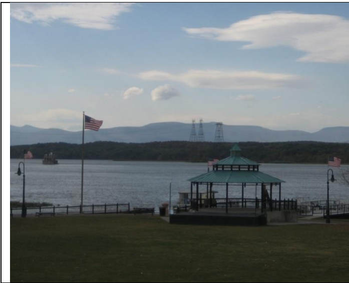
Hudson Waterfront Park

Maps of each of these preservation areas are available on their respective websites: ScenicHudson.org/parks/HarrierHill and CLCtrust.org/public-conservation-areas/greenport . These parks coupled with a tour of Hudson make for a full day trip.