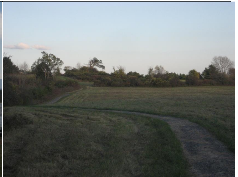
Harrier Hill Park