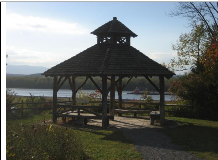
Greenport Conservation Area