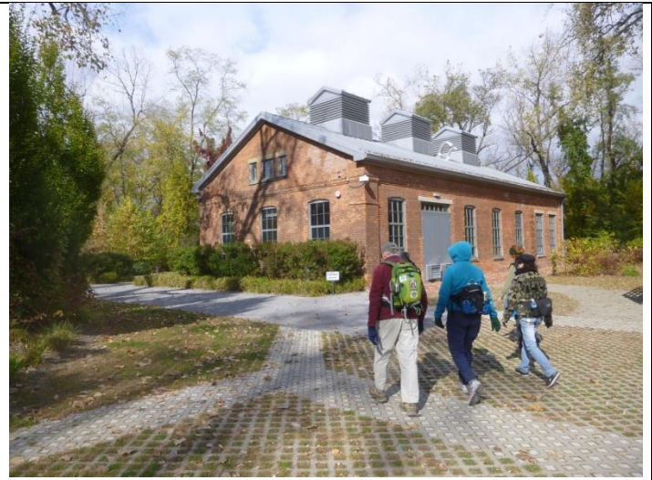
Beacon Institute for Rivers and Estuaries