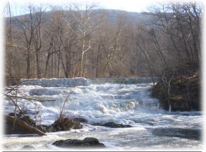
Waterfall at Madam Brett Park

In Beacon is all that John Burroughs writes about in nature: "To the scientist, nature is a storehouse of facts, laws, processes; to the artist, she is a storehouse of pictures; to the poet, she is a storehouse of images, fancies, a source of inspiration; to the moralist, she is a storehouse of precepts and parables; to all may she be an object of knowledge and joy."