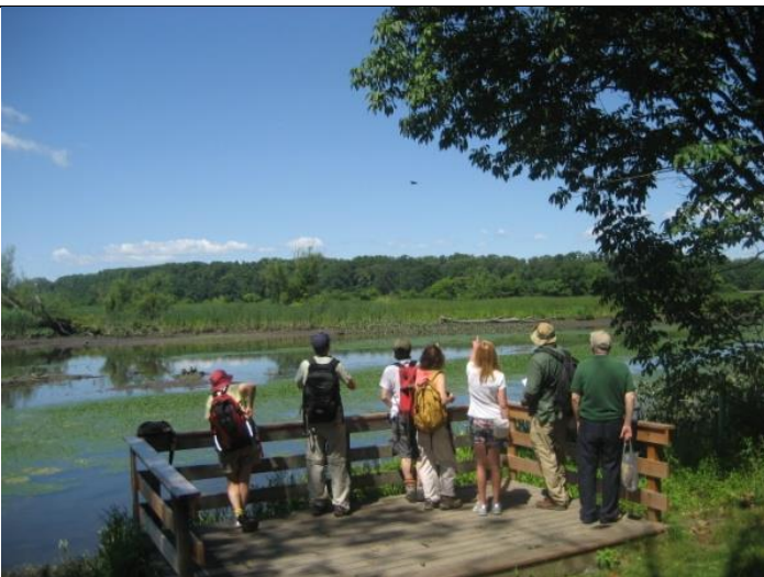
Wildlife observation platform