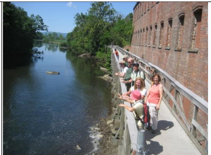
Boardwalk along Fishkill Creek