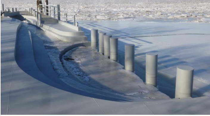
Long Dock Park