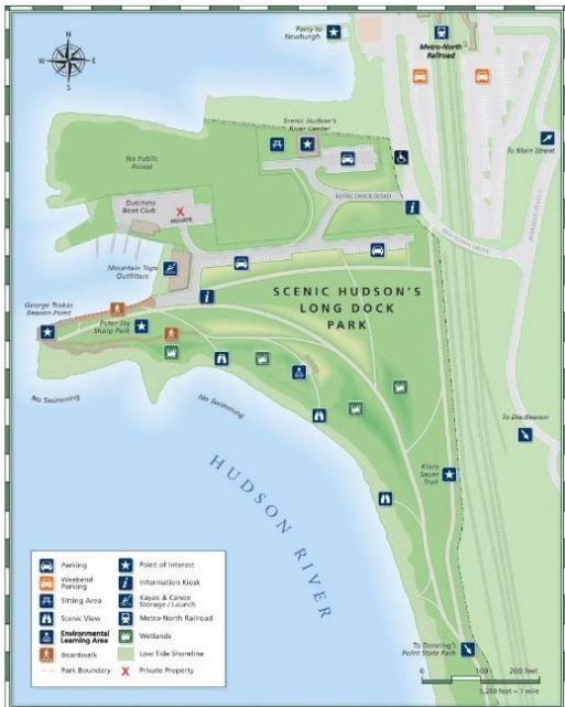
Long Dock Park map